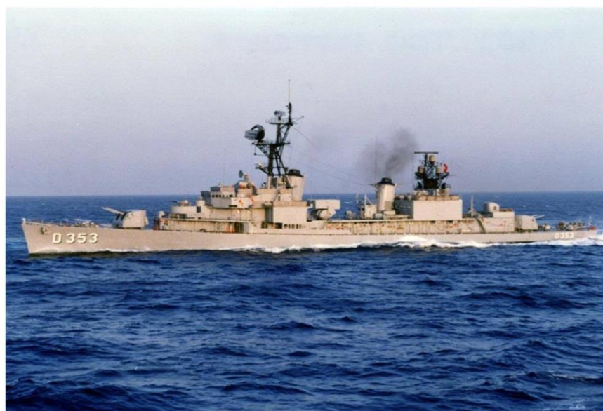
TCG ADATEPE D-353