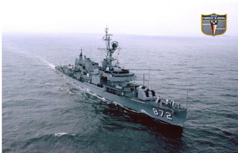
USS FORREST ROYAL DD 872